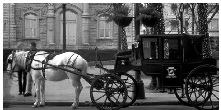
Modern Horse Drawn Carriage in Chicago