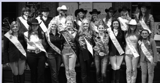
2014 Illinois Horse Fair Queen/Princess Pageant Candidates

The pageant helps to give the contestants life-long skills, both personal and horse related. The Illinois Horse Fair Queen and Princess act as ambassadors of the spirit of horse husbandry as epitomized at the Illinois Horse Fair and by the Horsemen's Council of Illinois.